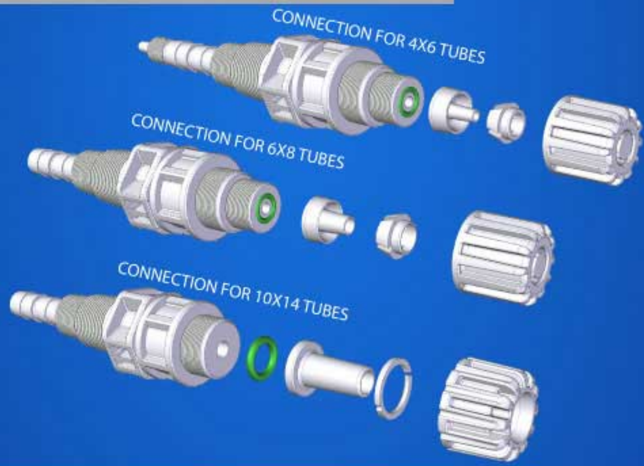
3 Setting in Just One Product