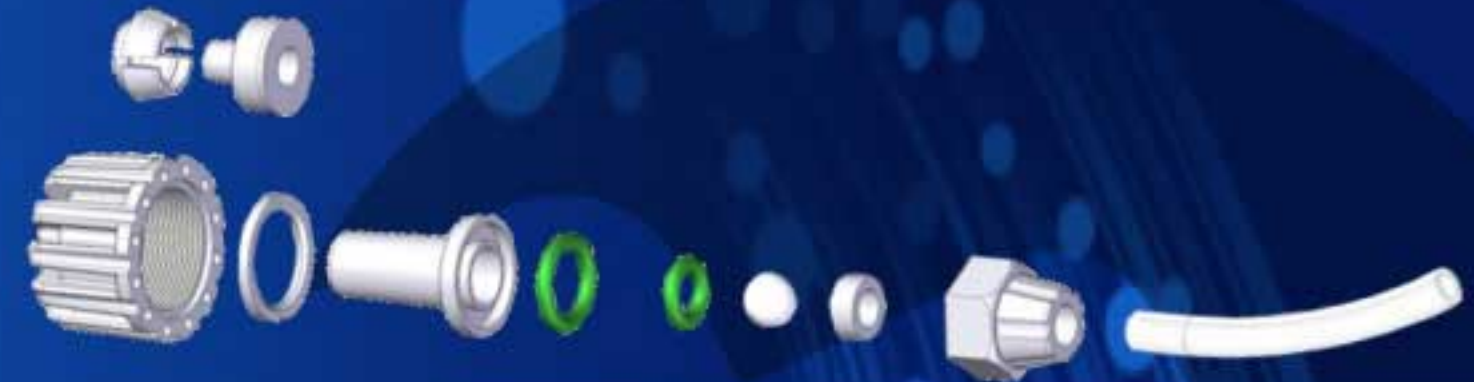
Parts Included in the Kit